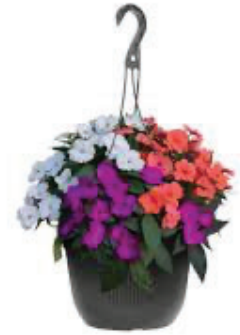
12. Impatiens Standard Basket Mixed