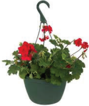
Geranium Ivy Basket 11a. Red 11b. Pink

This 10" sun loving basket contains several flowers with colors varying.