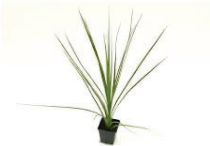
13a. 4" Spike