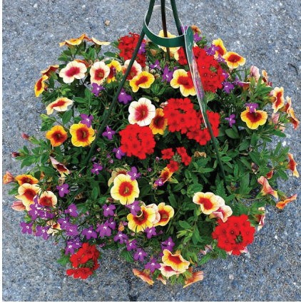
10. Confetti Mix Basket

This 10" sun loving basket contains several flowers with colors varying.