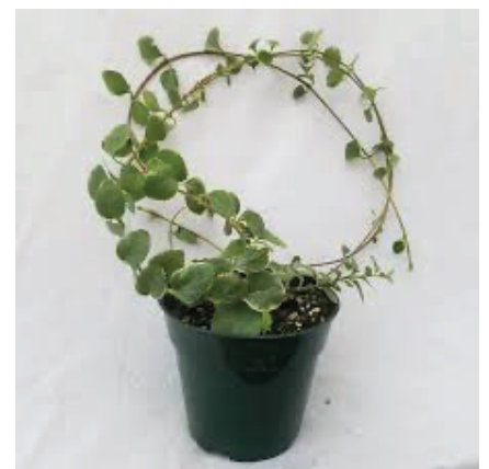
13b. 4" Vinca Vine